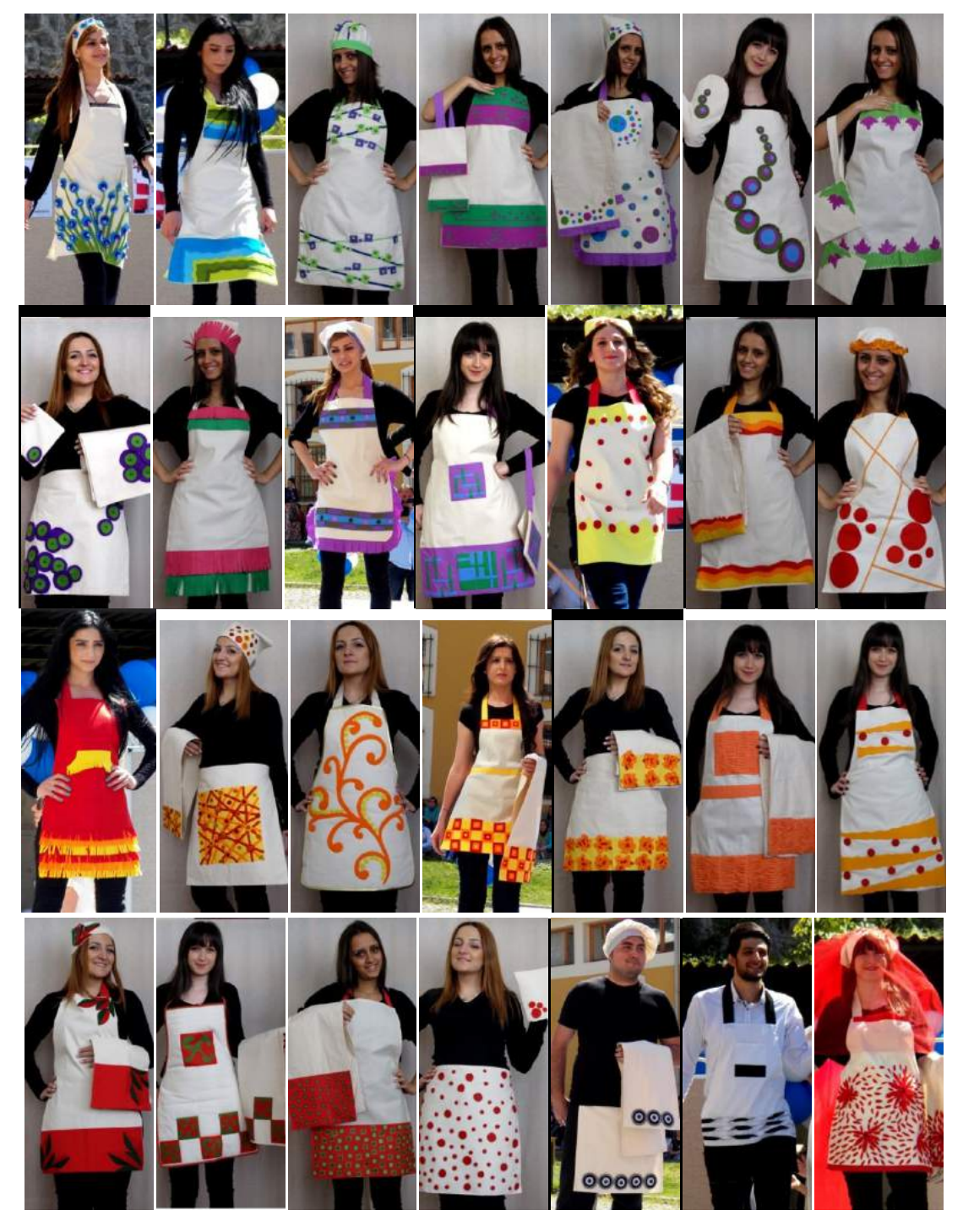
Figure 4. Designed aprons